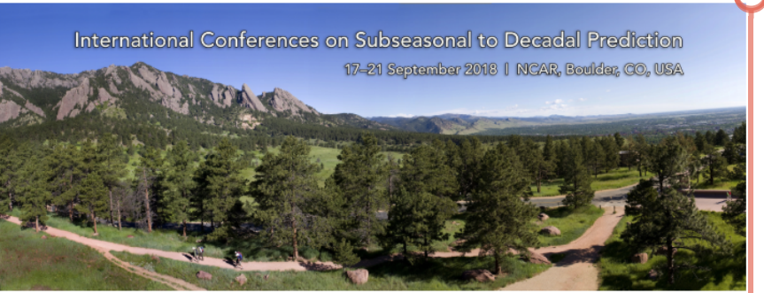
FEATURING A TPOS 2020 SIDE EVENT:

26-28 September 2018 Woods Hole, Massachusetts, USA