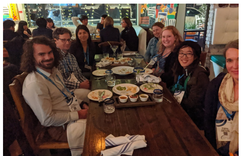
Group photo from TPOS Networking Event at the 2020 Ocean Sciences Meeting.

The Steering Committee meeting was focused on identifying unfinished business of the current Steering Committee and task teams, the future governance structure of TPOS 2020, and the transition process to the new structure. The 3rd, and Final, Report was also outlined based off these discussions and upcoming work. Look for the complete SC-6 Meeting Report on tpos2020.org coming soon.