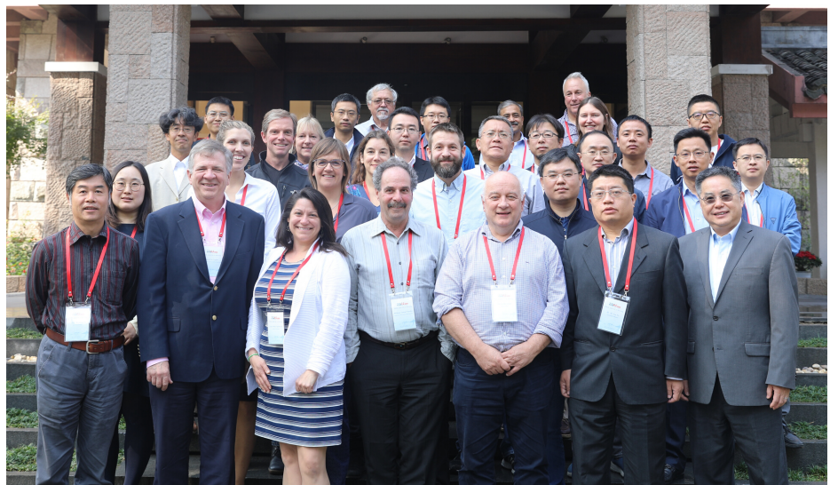
Participants of the SC-6 Meeting in front of the venue in Hangzhou, China.

The technical workshop focused on reinvigorating the development of a "Core TMA Technical Document" and sharing TPOS-relevant Chinese activities. An updated author list from all relevant agencies was identified and it was agreed that this document will be (continued on next page)